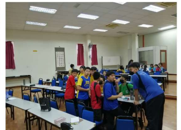
School student activities