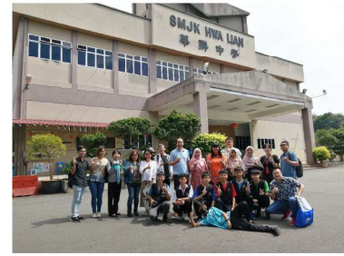
DAY 2 Group Photo-2 of school visit in Mentakab Pahang