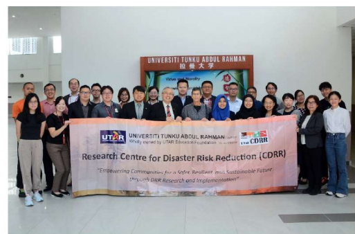
Group Photo of First Day Event