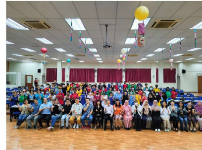
Group Photo-1 of Second Day Event