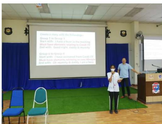
School student activities