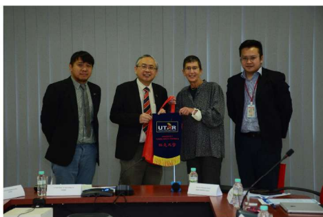
Presentation of Token of Appreciation to the representative from Kobe University, Japan, by UTAR President