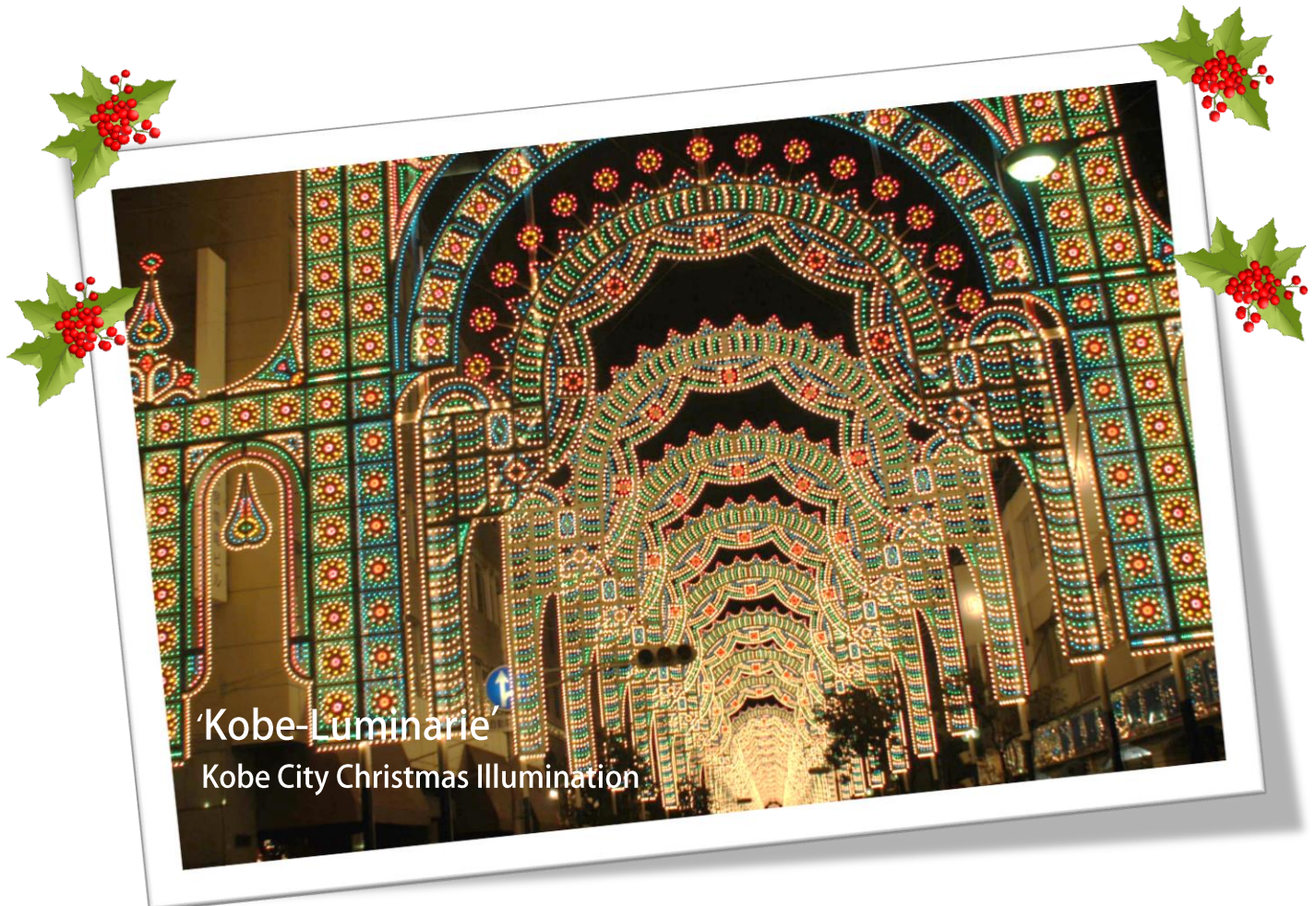
'Kobe-Luminarie' Kobe City Christmas Illumination

Boulevard de la Plaine 5 Pleinlaan, Bruxelles 1050 Brussel Email : intl-kobe_u_bxl(a)office.kobe-u.ac.jp Copyright © 2017 Kobe University. All Rights Reserved.