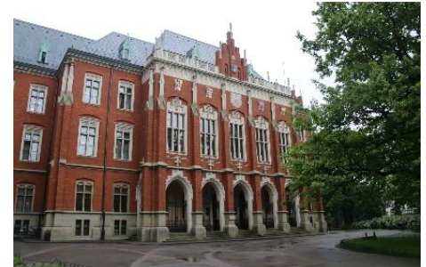
↑ Kobe University Liaison Office in Kraków

http://www.office.kobe-u.ac.jp/ipiep/ceus/poland_en.html